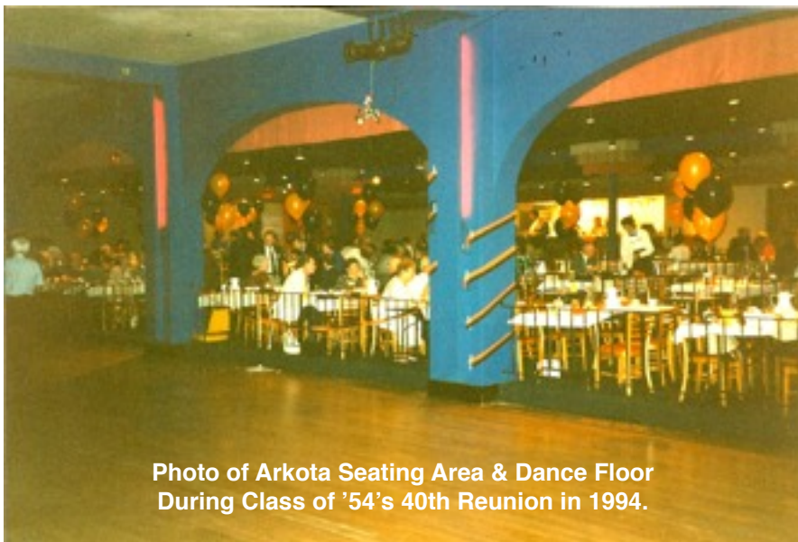
Photo of Arkota Seating Area & Dance Floor During Class of '54's 40th Reunion in 1994.

and the distance made things difficult to maintain.