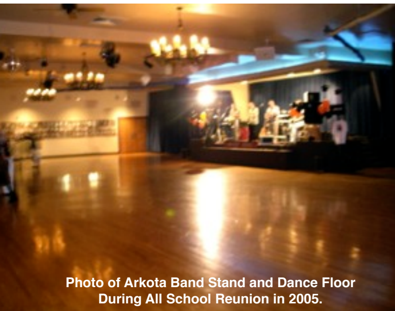
Photo of Arkota Band Stand and Dance Floor During All School Reunion in 2005.