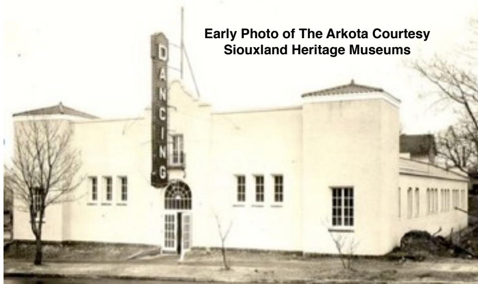
Early Photo of The Arkota