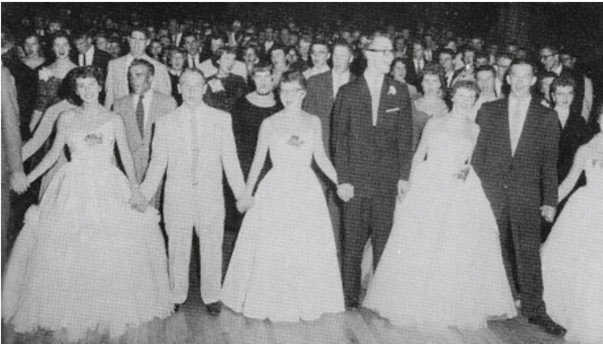
Homecoming Royalty leading the Grand March in 1954/55.