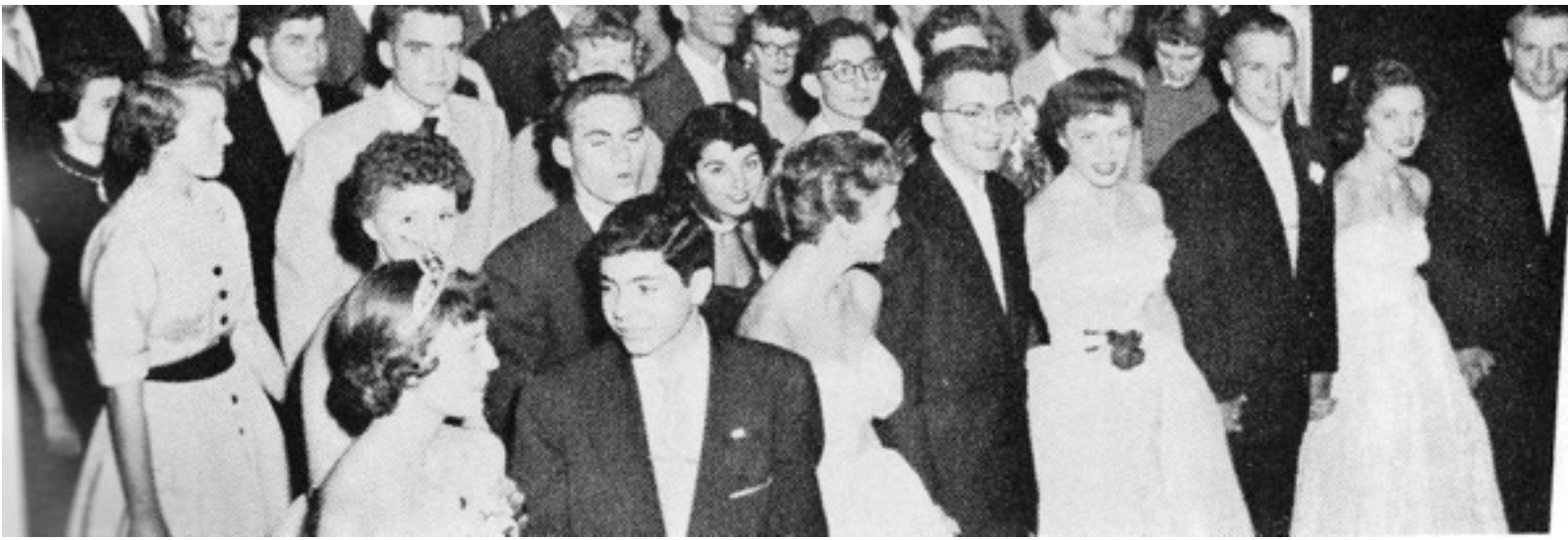
Homecoming Royalty leading the Grand March in 1952/53.